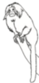
golden lion tamarin (a monkey)