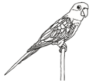
sun conure (a parrot)

3. Draw the animals in the rainforest layers picture.