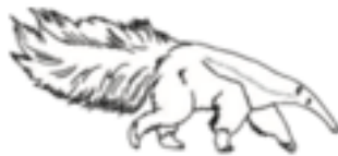
giant anteater (a large mammal)