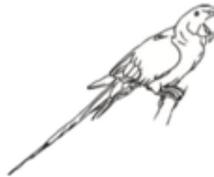
blue and yellow macaw (a parrot)