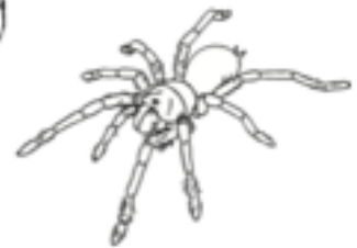
Brazilian salmon tarantula (a large spider)