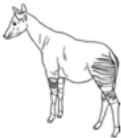
okapi (a giraffe-like mammal)

2. Write the name of the animal beside the layer it lives in.