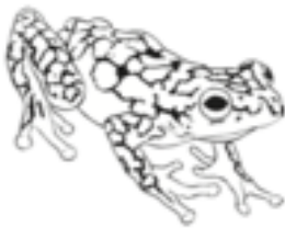
poison frog (an amphibian)