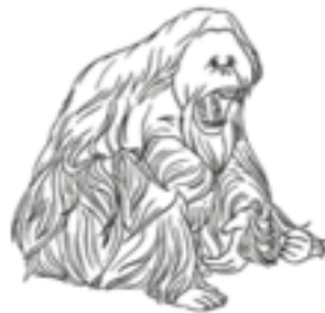
orangutan (a great ape)